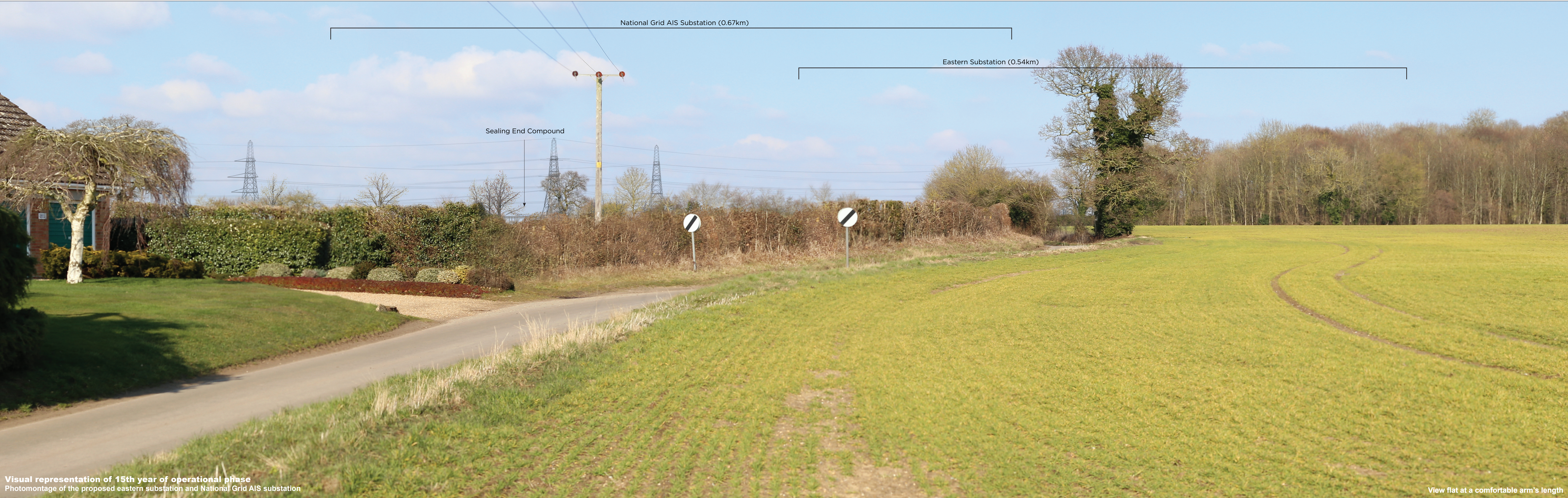
Visual representation of 15th year of operational phase Photomontage of the proposed eastern substation and National Grid AIS substation