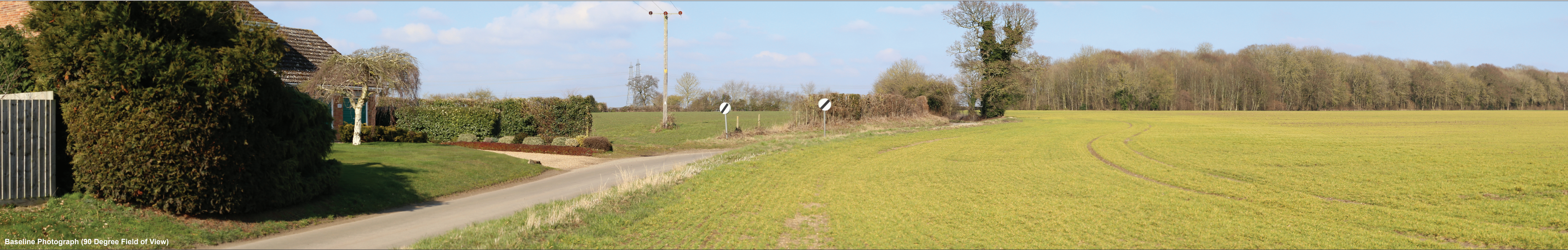
Baseline Photograph (90 Degree Field of View)