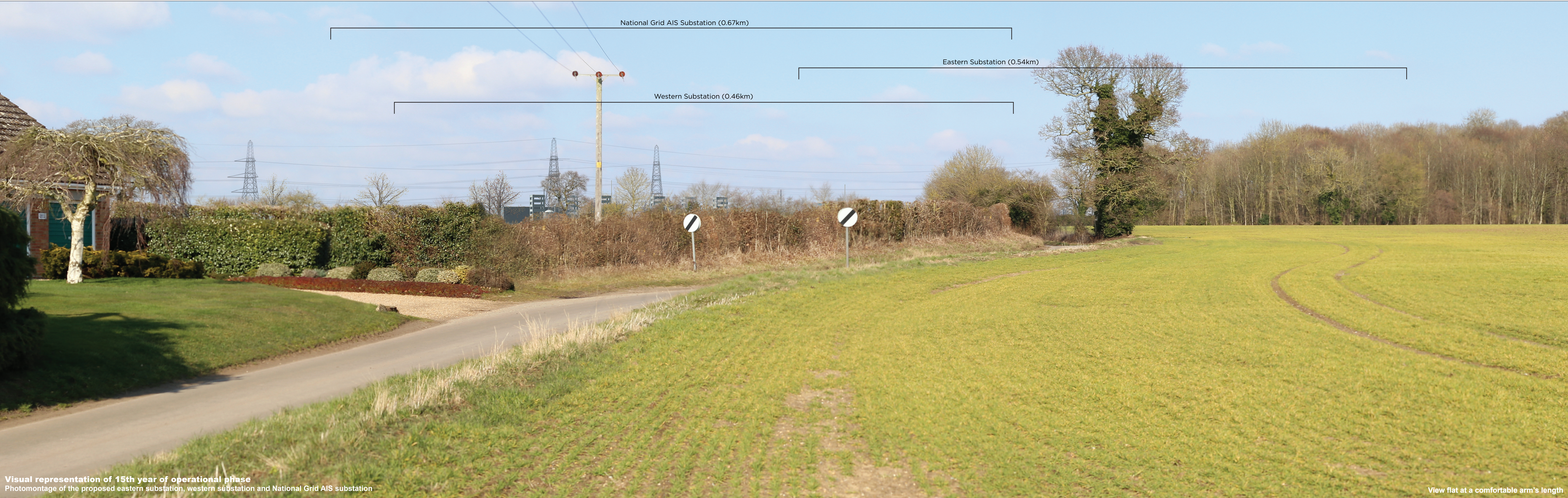
Visual representation of 15th year of operational phase Photomontage of the proposed eastern substation, western substation and National Grid AIS substation