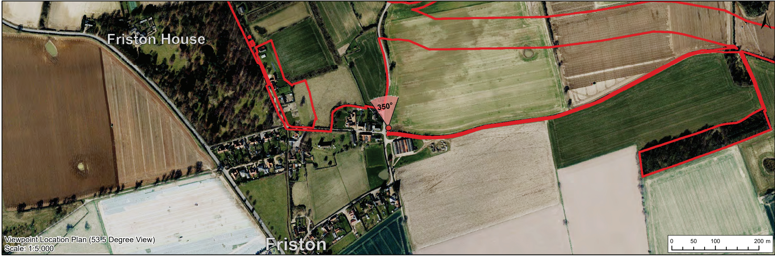
Viewpoint Location Plan (53.5 Degree View) Scale: 1:5,000