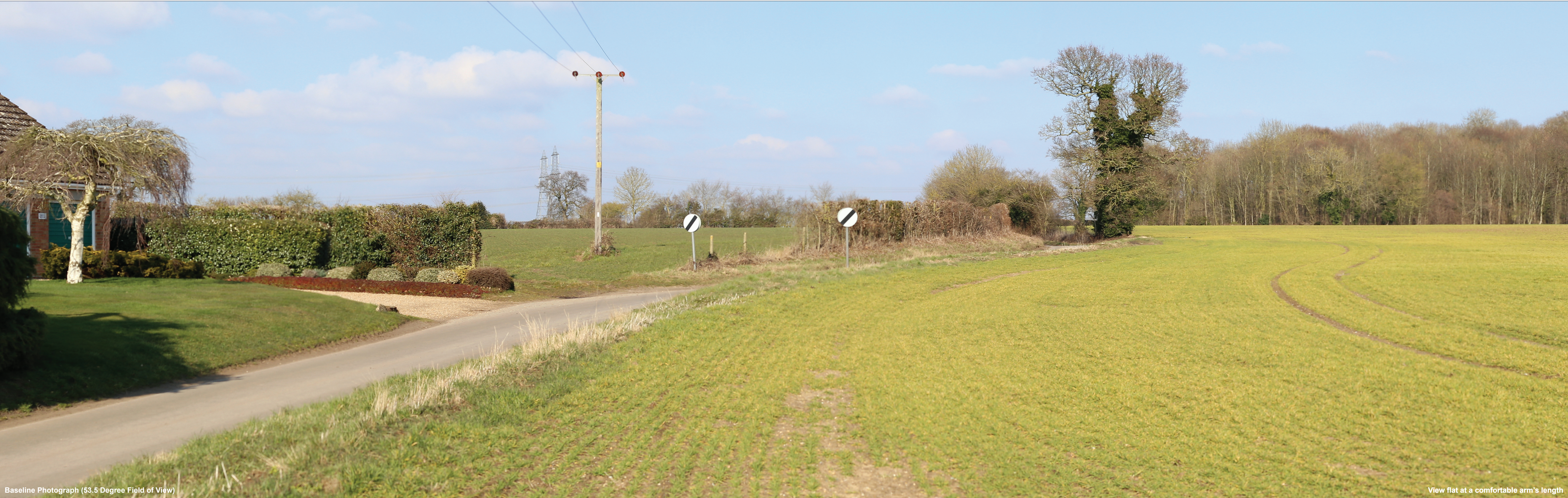
Baseline Photograph (53.5 Degree Field of View)