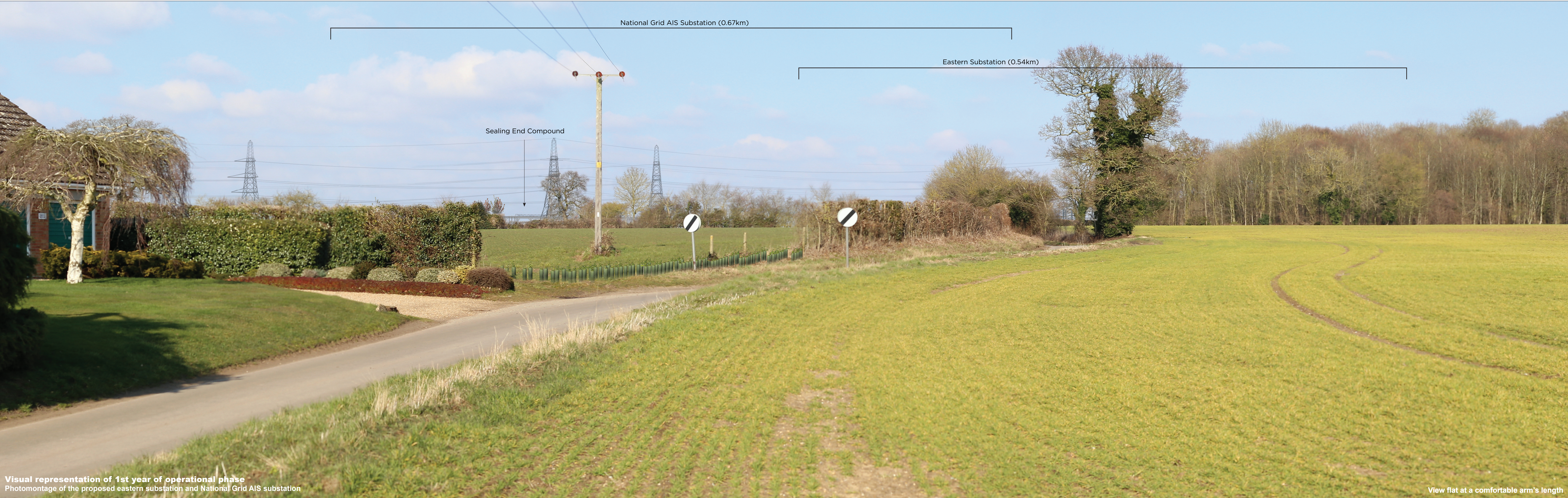
Visual representation of 1st year of operational phase Photomontage of the proposed eastern substation and National Grid AIS substation