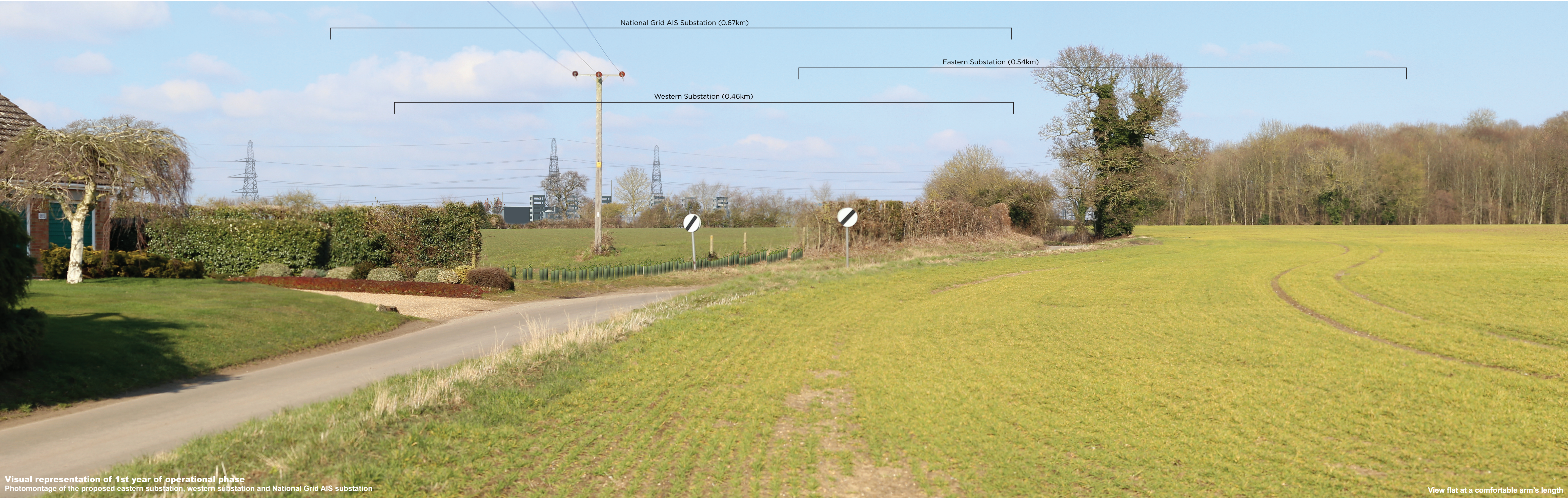
Visual representation of 1st year of operational phase Photomontage of the proposed eastern substation, western substation and National Grid AIS substation